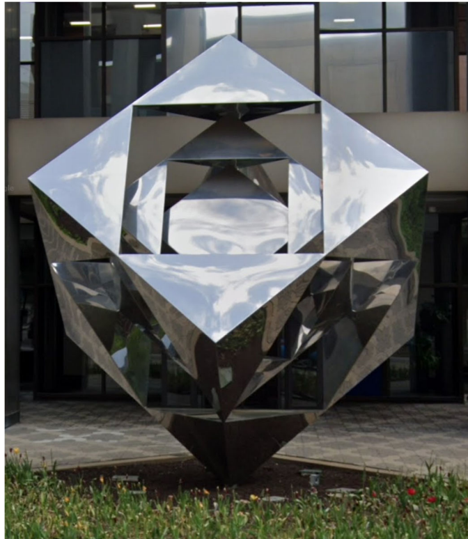
Photo of Sculpture